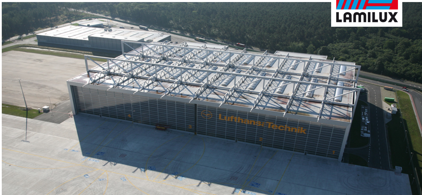
Световые полосы на сборочном цехе lufthansa technik, германия